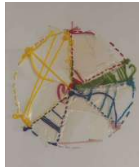
De Volkskrant - Remembrance of the Dead